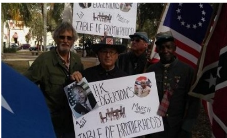
TCCR Staff Photo 1-20-2020

frequent visitor to St Augustine, Florida, in an attempt to save the oldest Veteran’s Memorial in the State of Florida. Notable appearances occurred on Martin Luther King Day, January 20, 2020 and on July 4, 2020. On Independence Day the historic district was shut down by “City Officials” due to the fake pandemic and there were no tourists present. However, hundreds of local demonstrators appeared in the Plaza. A motorcade, led by the Saint Augustine Tea Party’s Dartmouth, proceeded to the Mayor’s house to protest his support of BLM calls for the removal of the monument. The monument was ultimately removed