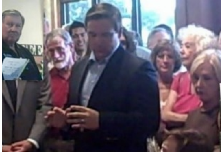
TCCR Staff Photo August 2013

When Congressional Districts 6 and 7 were redrawn incumbent, John Mica, chose to run in District 7, leaving a vacancy in the newly redrawn District 6. Ron DeSantis jumped into the race and won the primary with only 39%. He easily won the general election because it was a red district. During his first year Congressman DeSantis established a conservative record. On August 22, 2013 the SJC-REC organized a coffee clutch for certain Republican elites at the City Coffee Shop in St. Augustine, Fl. [The restaurant only seats 35.] The SATP showed up with 125 additional Patriots to show their