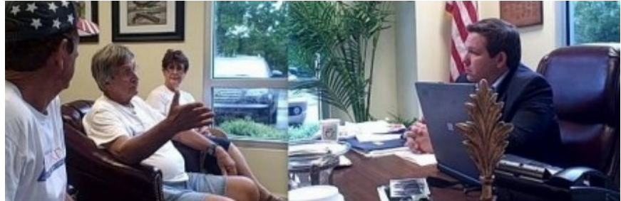
TCCR Staff Photo August 2013

On February 19, 2009, from the floor of the Chicago Mercantile Exchange, Rick Santelli's live spontaneous outburst on CNBC inspired those watching to launch what was to become "The Tea Party Movement."