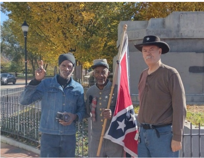
HR Photo 10-14-2022