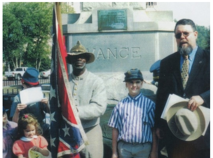
HR Photo 10-14-